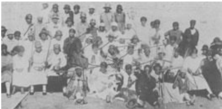
and boycotts. 1929.