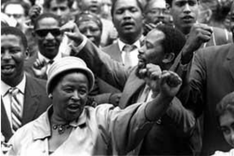
The crowd outside the courts "standing by their leaders". The Treason Trial. 1955.

In the 1950s the government's increasingly repressive policies began to pose a direct threat to all people of colour, and there was a surge of mass political action by blacks in defiant response. The 1950s certainly proved to be a turbulent decade. We shall see that women were prominent in virtually all these avenues of protest, but to none were they more committed than the anti-pass campaign.