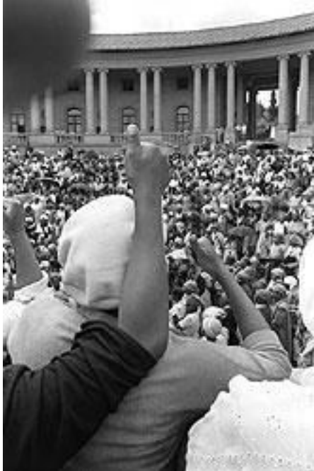
9th August Union Buildings © Baileys Archives.

'Strijdom, you have tampered with the women, You have struck a rock.' So runs the song composed to mark this historic occasion