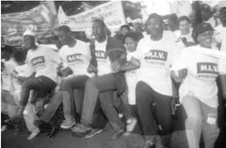
HIV (Aids) protest at an Aids conference. Durban. 2000.

South African society remains a pluralist one with huge cultural diversities, and there are many challenges ahead. Furthermore, in modern-day South Africa women are faced with a wide range of issues such as the high crime rate, domestic violence, child abuse, HIV/AIDS, poverty, poor local government delivery and unemployment. Motherhood is still central to most women's lives across the board and women's role in family life is still the basis of a morally sound, orderly society. Although great strides have been made, gender discrimination still takes place in the workplace, and while there are notable exceptions, women are as yet poorly represented in top managerial and executive posts country-wide.