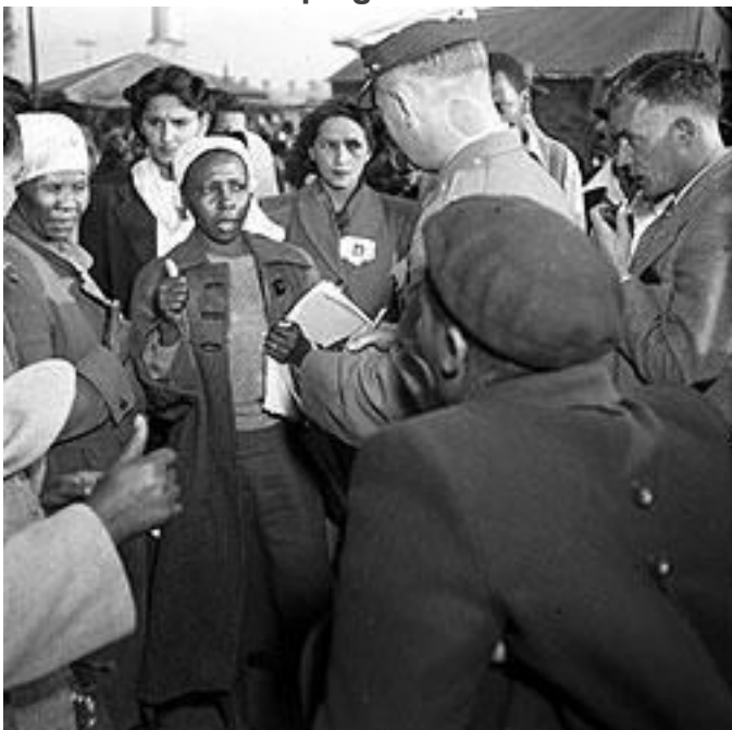
Women during the Defiance Campaign 1952.

In June 1952 the ANC and SAIC initiated a cooperative initiative known as the Defiance Campaign. Radical tactics of defiance were to be employed to exert pressure on the government. This was in line with the ANC's declared 'Programme of Action' of 1949. Volunteers from the ANC and SAIC (the CPSA had disbanded in 1950) began to publicly defy discriminatory laws and invite arrest, filling the jails and