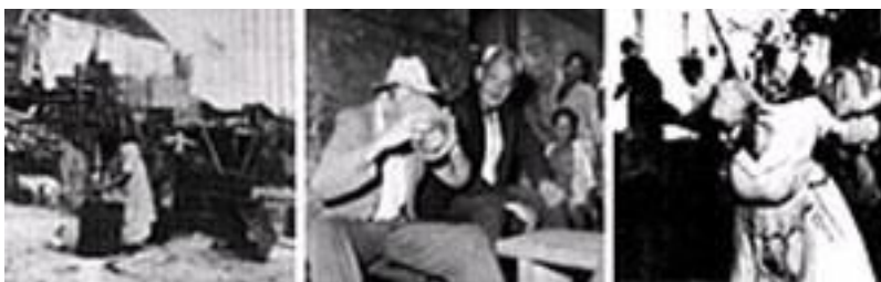
From left to right: Woman brewing beer in the township; Men drinking traditional beer in the shebeen; Police