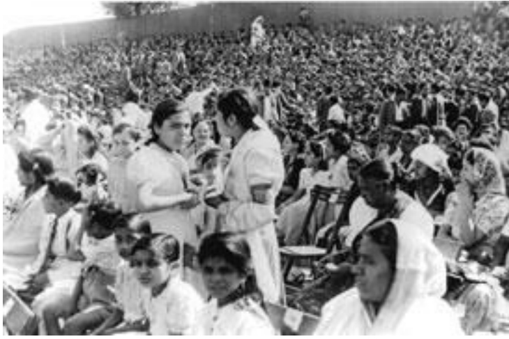
Indian Passive Resistance. A mass meeting in Johannesburg. 1946-1948.

Although Indian women had become involved in Gandhi's passive resistance of 1913 they did not attempt to form any long-term women's organisations or play an overt political role again until the 1940s. The SAIC also experienced a period of relative inactivity until the Second World War. The war itself had a radicalising impact on the SAIC and as had happened in the ANC, more assertive leaders took over from the old guard of the SAIC.