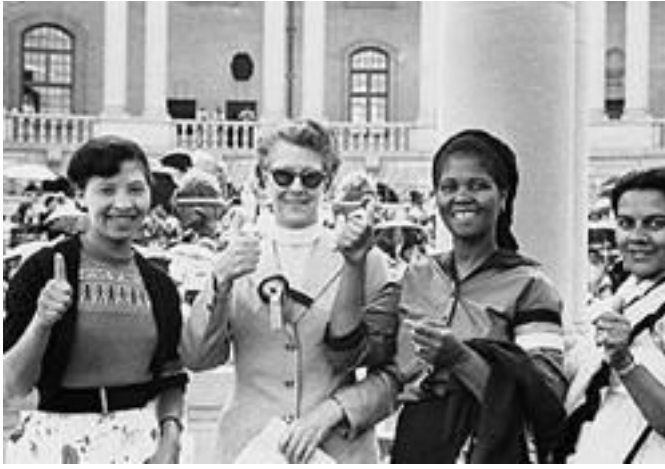
Women's March 9th August 1956 Union