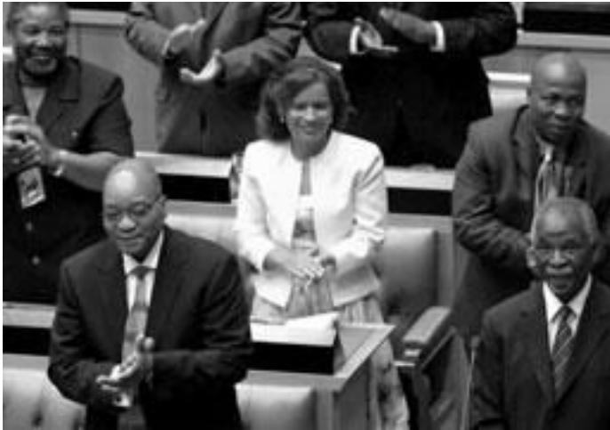
Women in Parliament. The opening of Parliament 2005.

Soon after the election in 1994, the new Minister of Justice, Dullah Omar, proposed the idea of the Truth and Reconciliation Commission (TRC). The commission was set up in 1995 and statements were heard by more than 20 000 people, including women. No women applied for amnesty. In 1996 a new constitution (with provision for women's rights) was introduced and importantly for women, a Commission for Gender Equality was set up. The first 10 years of democracy have been remarkable in many ways but there are still a number of crucial challenges to be met.