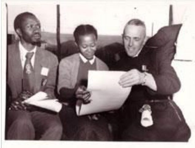
The launch of the Freedom Charter.