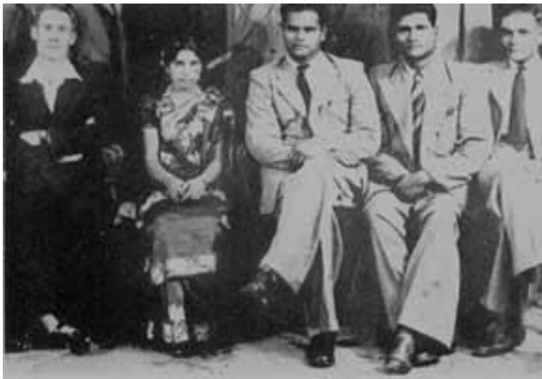
Natal Trade Unionists. 1930s.

The 1930s - Trade unionism blossoms and women become more assertive ↵