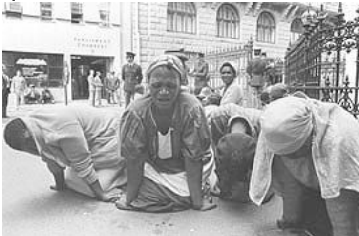
Women from the Crossroads squatter camp demonstrate outside parliament demanding protection from Witdoek (white headband vigilantes for the right to rebuild their bent-out hopes). Cape Town. June 1986.

The 1980s saw escalating state repression and mass detentions. In a frenzy of desperate reaction, the government declared a series of back-to-back states of emergency from 1985 to 1987. In 1988 a number of organisations including the UDF and COSATU were restricted. In 1984 PW Botha made a desperate effort to make reforms by introducing the tricameral constitution: three parliaments were set up, one each for whites, Coloureds and Indians. But this was widely rejected by the Coloured and Indian people and seemed doomed to fail from its very inception.