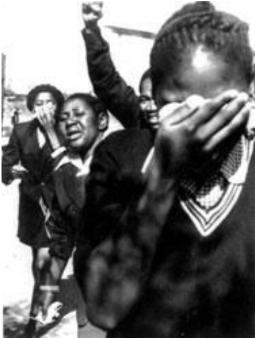
African History Archives

The Day Our Kids Lost Faith. 1976. © Bailey's