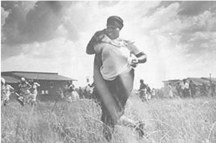
Sharpeville Massacre. Running from the violence after police open fire on the protesters. October 1960.

As the 1950s gave way to the 1960s the ANC and PAC both announced plans to tackle the pass laws for blacks (both men and women) with massive protests, civil disobedience and pass burnings. There was a sense of rivalry between the two organisations to get their campaigns off the ground first.