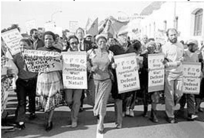
Members of the ANC and its ally's protest against the state sponsored violence in Natal. Cape Town. 1993.

By the time the 1980s drew to a close the revolt against the government, increased international pressure and the regime's counter-revolution of oppression had reduced the country to a state of anarchy. Violence escalated in the 1990-1994 period with more than 700 people dying violently in the first eight months of 1990. The economy was in shreds and there was still no real constitutional reform that would give the blacks any meaningful say in government. FW de Klerk realized that reform had to take place and in the March 1992 referendum, 68,6% of the whites who voted gave him the mandate to bring about changes.